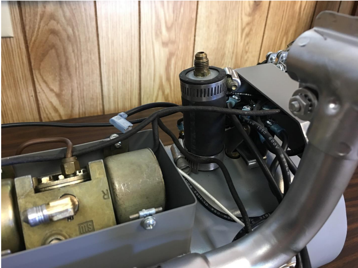
FIGURE 4 - Combustion Air Inlet Tube – Pressure Supply Assembly Installed