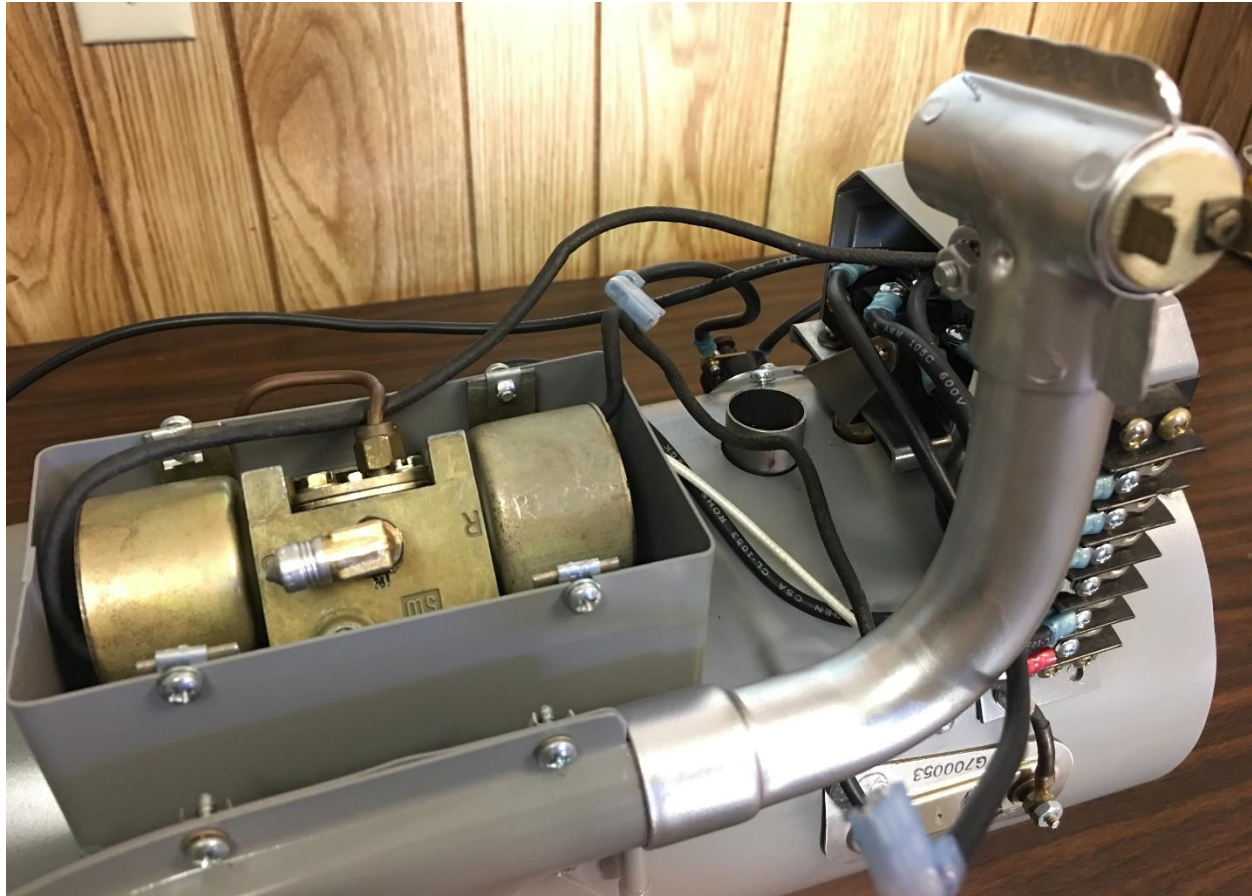
FIGURE 3 - Combustion Air Elbow and Thermal Fuse Assembly Shown In Raised Position

inflation. See Figure 5. Products of combustion may need to be cleaned from inside of exhaust tube if the build-up is large enough to keep the bulb from sealing. Deposits may be removed by brushing or scraping.