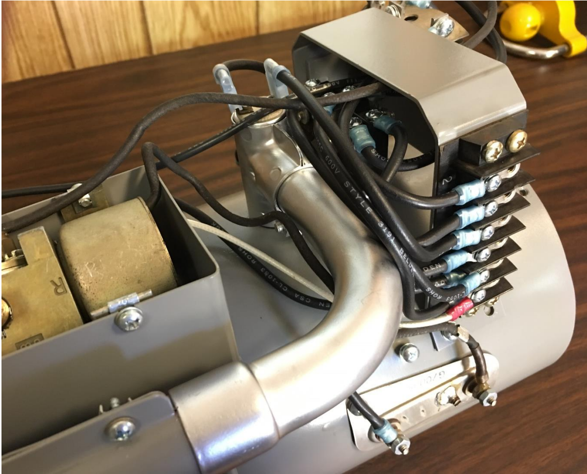
FIGURE 2 - Combustion Air Elbow and Thermal Fuse Assembly Shown Installed.